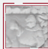
Accuracy up to 0.05 mm