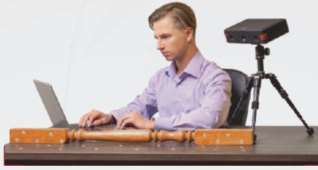
Scanning with markers