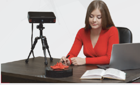
Scanning on a rotary table