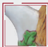
Colour texture capturing