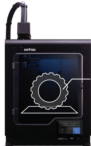
Zortrax M200 Plus 3D printer