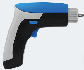
End-use drill-driver casing