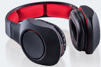
Functional headphones prototype